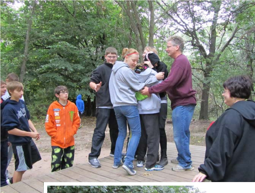
Our confirmation retreat was held on September 16 & 17 at Camp Pepin. Pictured here, our 8th graders work on team building events.