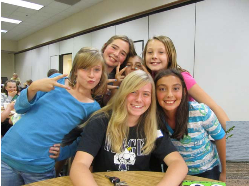
Left: Delight In God (DIG) is off go a good start!