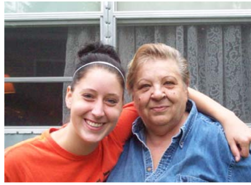
United Lutheran teens spent the day before workcamp touring New York City. They spent a week in Owego, New York doing home repair projects for local residents. Workcamp also included time for play, inspiring worship, and devotions. We stopped to see Niagra Falls (left) on the way home.